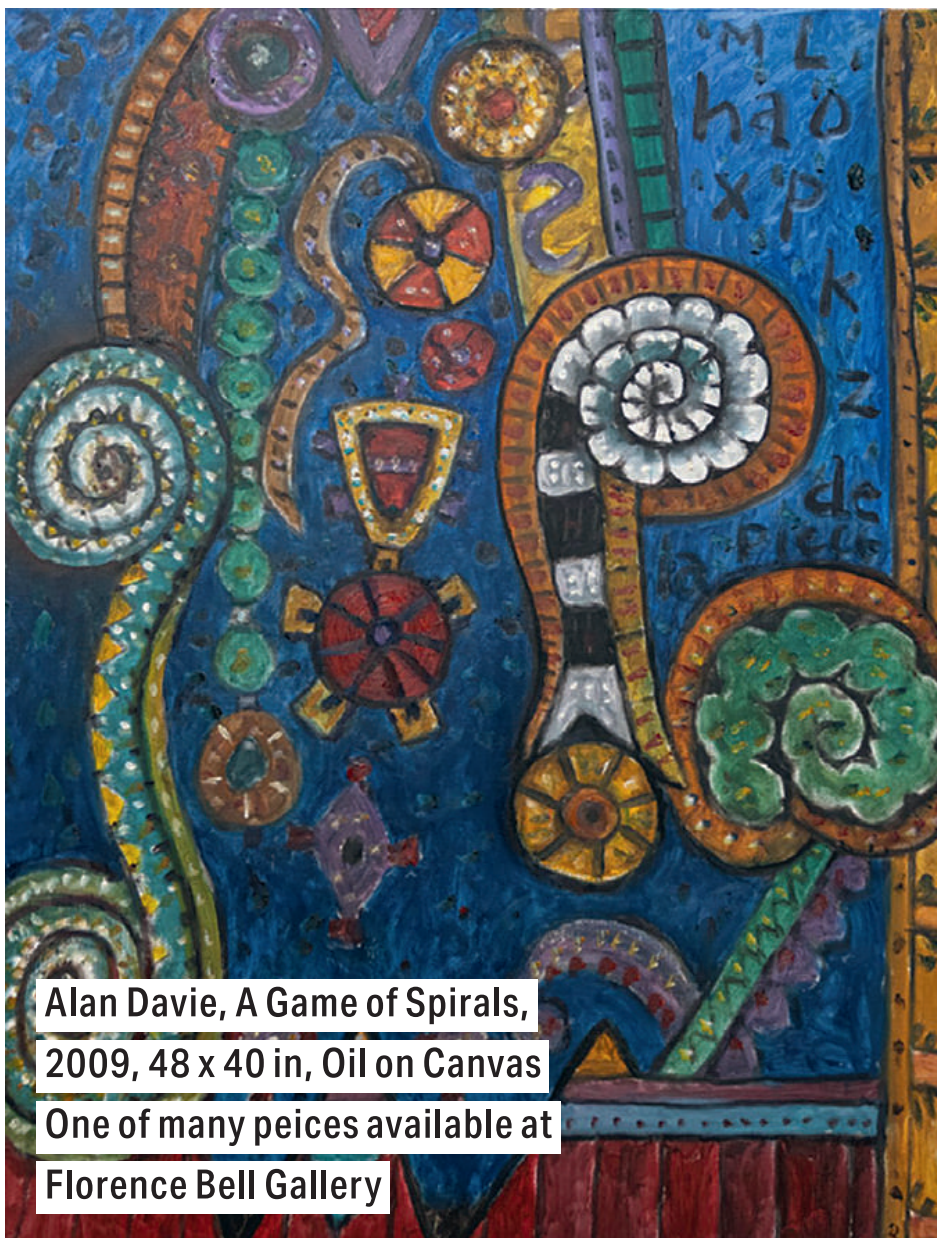
Alan Davie, A Game of Spirals, 2009, 48 x 40 in, Oil on Canvas One of many peices available at Florence Bell Gallery

Art is one of few investments which has a proven track record of showing a consistent return despite the state of the global economy. The current market conditions are favourable for both new and existing collectors and investors, who are seeing their portfolios increase substantially in value.